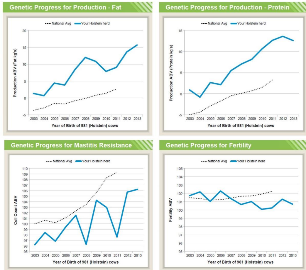
Figure 1. Genetic Progress Report Place herd (Protein kg, Fat kg, Cell count and Fertility)